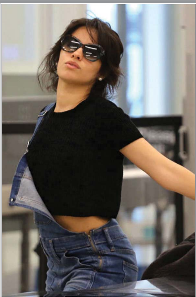
SILLY SINGER! "Havana" singer Camila Cabello struts her stuff in a plain black tee and overalls at the LAX airport.