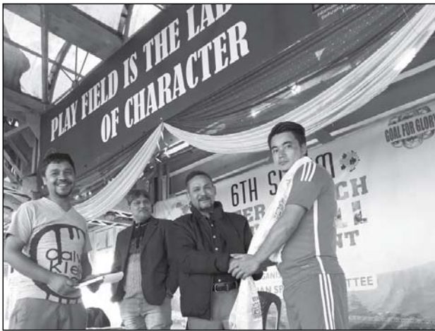
judged as the Man of the Match. The last quarter-final match will be played between defending champion, Regu Horeb and EPCS Sang at 1 p.m. on 17 Nov.