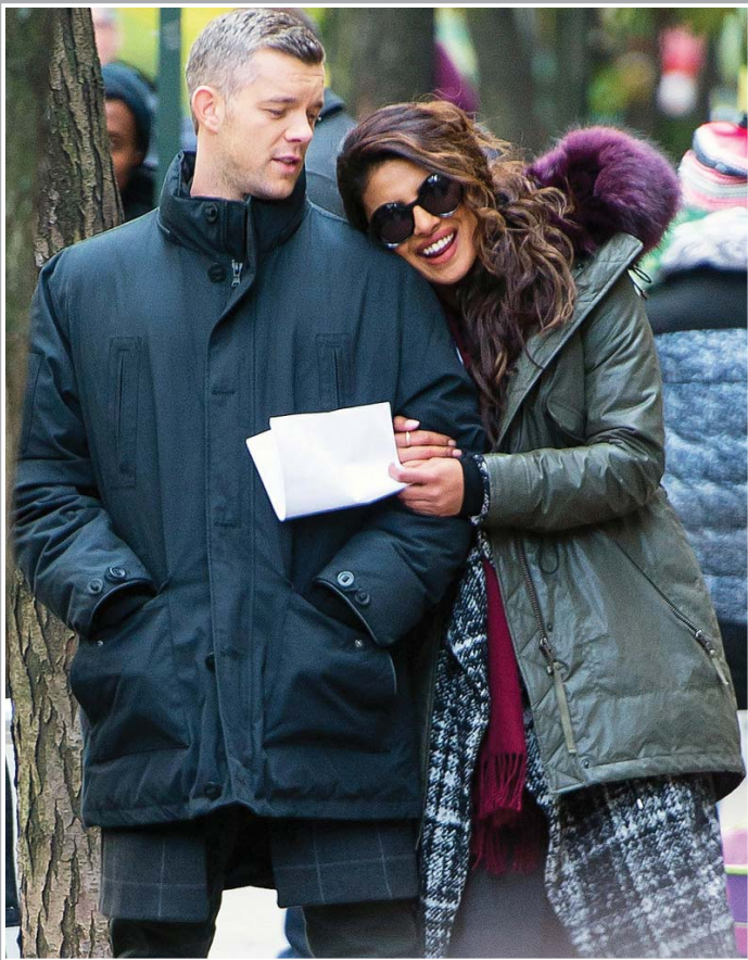
BUNDLE UP: Quantico stars Russell Tovey and Priyanka Chopra tried to keep warm on the set in New York City. The actors are filming season three of the popular FBI drama.