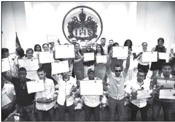
Former members of FARC receive diplomas from Javeriana University of Cali in July 2017.

Given this diversity, some will need literacy and basic education in order to move on to technical and professional education. Others will need to enrol in educational programs to acquire technical skills, which will allow them to apply for jobs and join the formal economy. A smaller group of ex-combatants, who may have had a stronger academic background when they joined the armed groups, will enrol directly into universities.